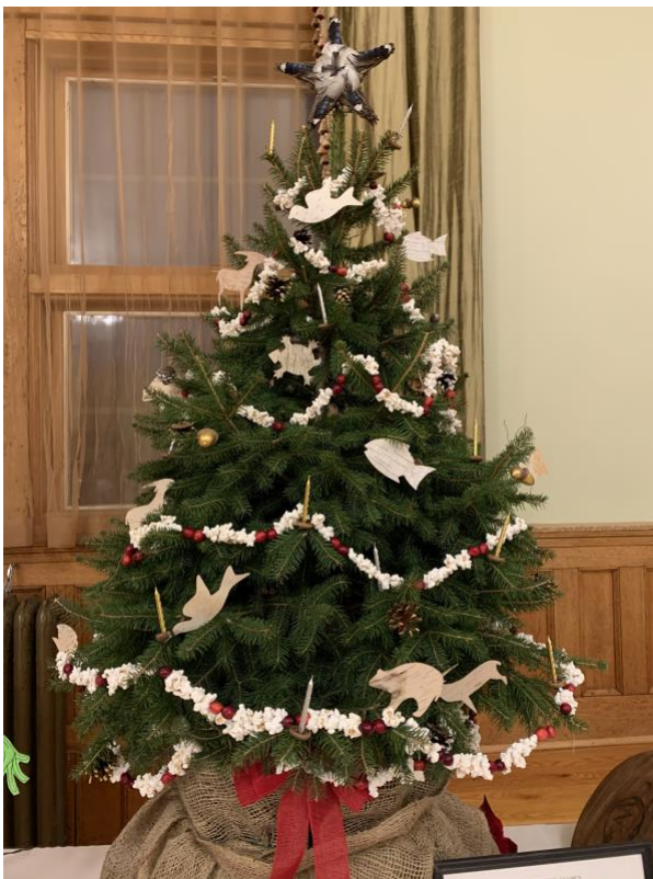
The Manistee Dems tree titled, "Spirit of the Woods."

The Festival of Trees for 2021 was a success and thanks to the Manistee Dems and other organizations for supporting this event.