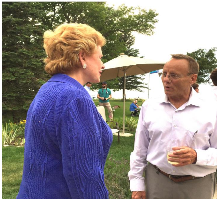
Senator Stabenow discussing Manistee County issues with County Commissioner, Alan Marshall

Sixty-five local Manistee County residents greeted Senator Debbie Stabenow on August 13 at a garden party hosted by the Manistee County Democratic Party at the Lake Michigan home of Al Frye and Jeanne Butterfield.