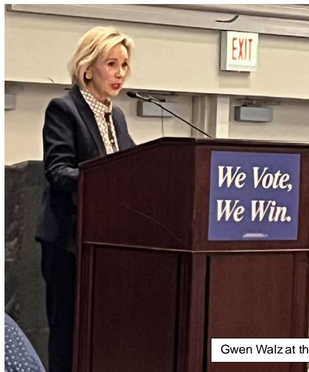
Gwen Walz at the Michigan breakfast

Sleep deprived zombie delegates slowly wandered into the ballroom for breakfast this morning. We heard speakers like Gwen Walz, Secretary Gina Raimondo, Secretary Deb Haaland, NY Governor Kathy Hochul, Maryland governor Wes Moore, US Reps Ro Kahanna and Debbie Dingel. The Michigan delegation is getting a lot of attention due to the combination of our progressive legislative majority and our executive branch triumvirate of strong, capable women. It is also very apparent that Michigan will be a true battleground state that the Harris/Walz campaign must win.